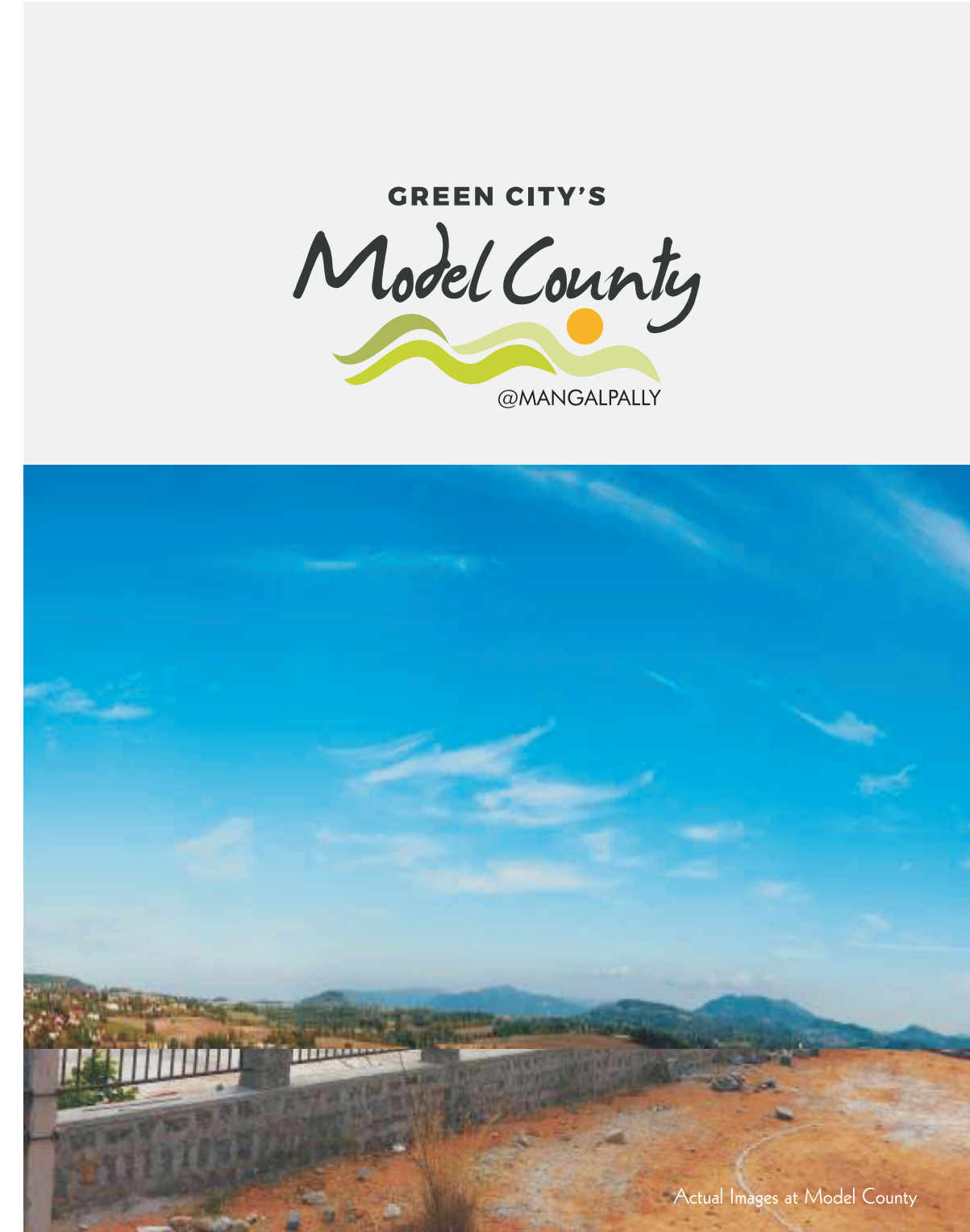
Actual Images at Model County