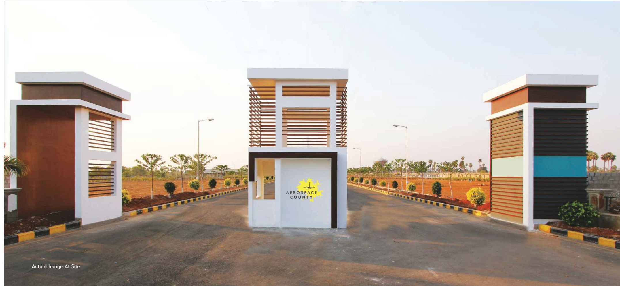
Actual Image At Site