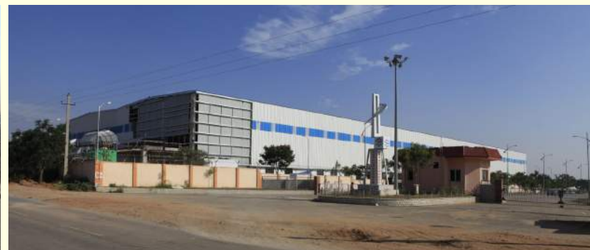
Tata Aerospace SEZ