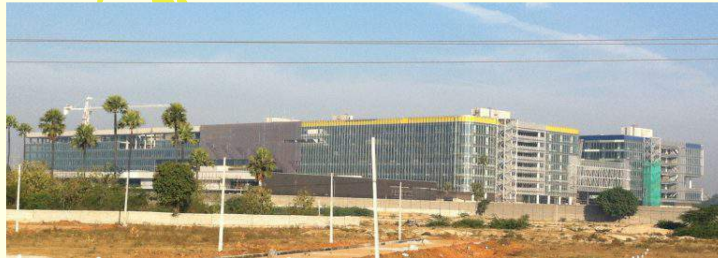
Tata Consultancy Services

Adibatla is well connected to Shamshabad Airport and Gachibowli through Outer Ring Road in 15 minute drive. The highway connects to LB Nagar Circle in another 15 minutes smooth drive on the north. Adibatla topography is beautiful and the connectivity is excellent. Your plot amidst new global development will appreciate multifold in a short period of time. Ensure a slice of future with a plot in Aerospace County.