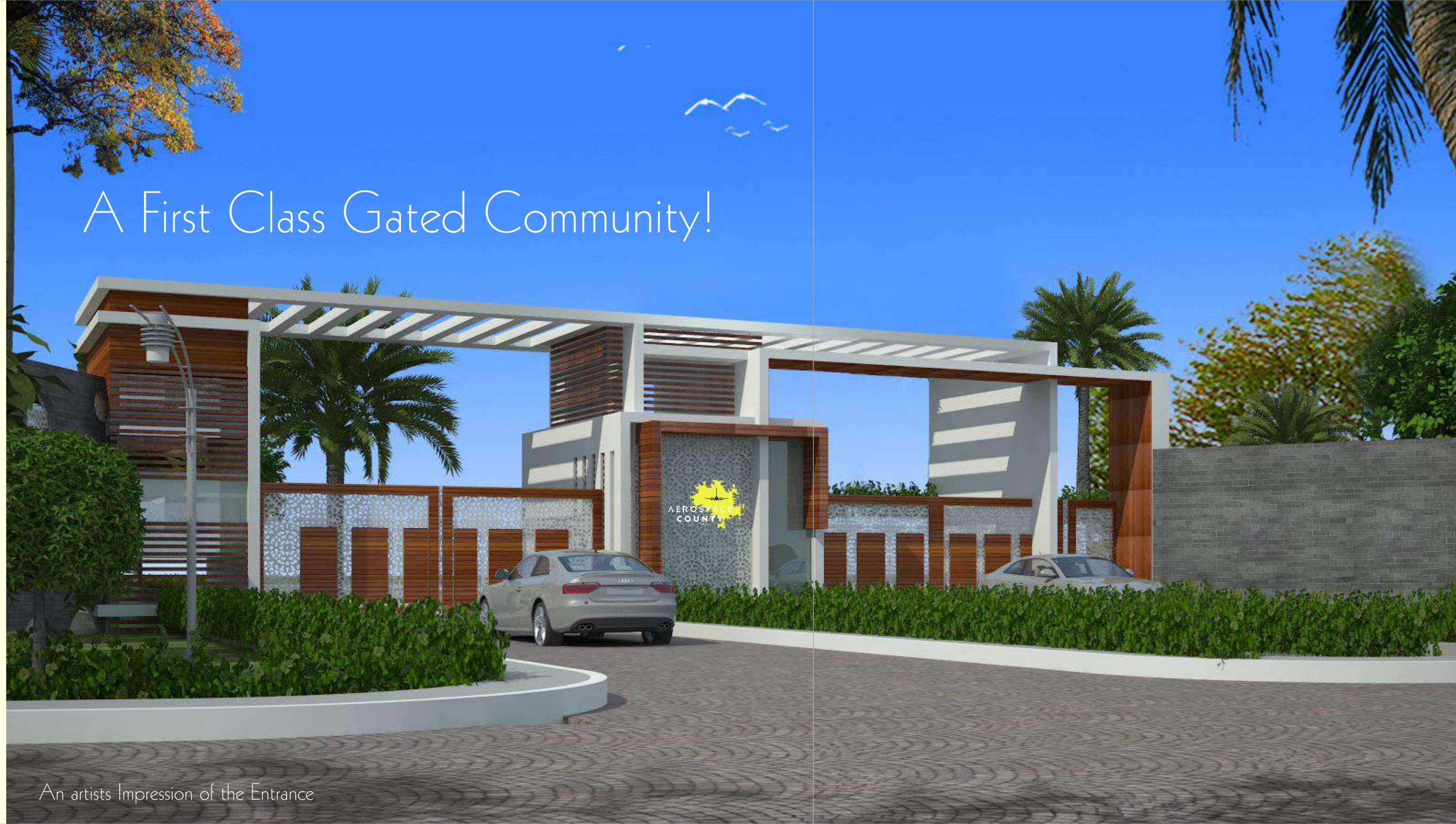
An artists Impression of the Entrance