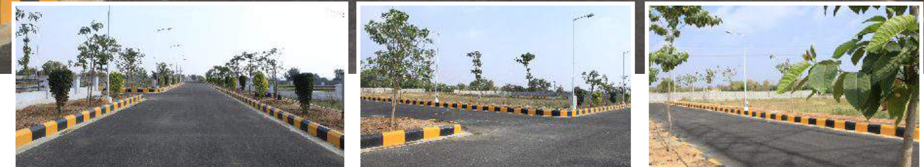
Actual Images of the developments at Gachibowli County

Our completed venture | Completed 7 phases