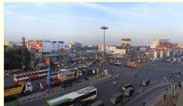
LB Nagar Circle