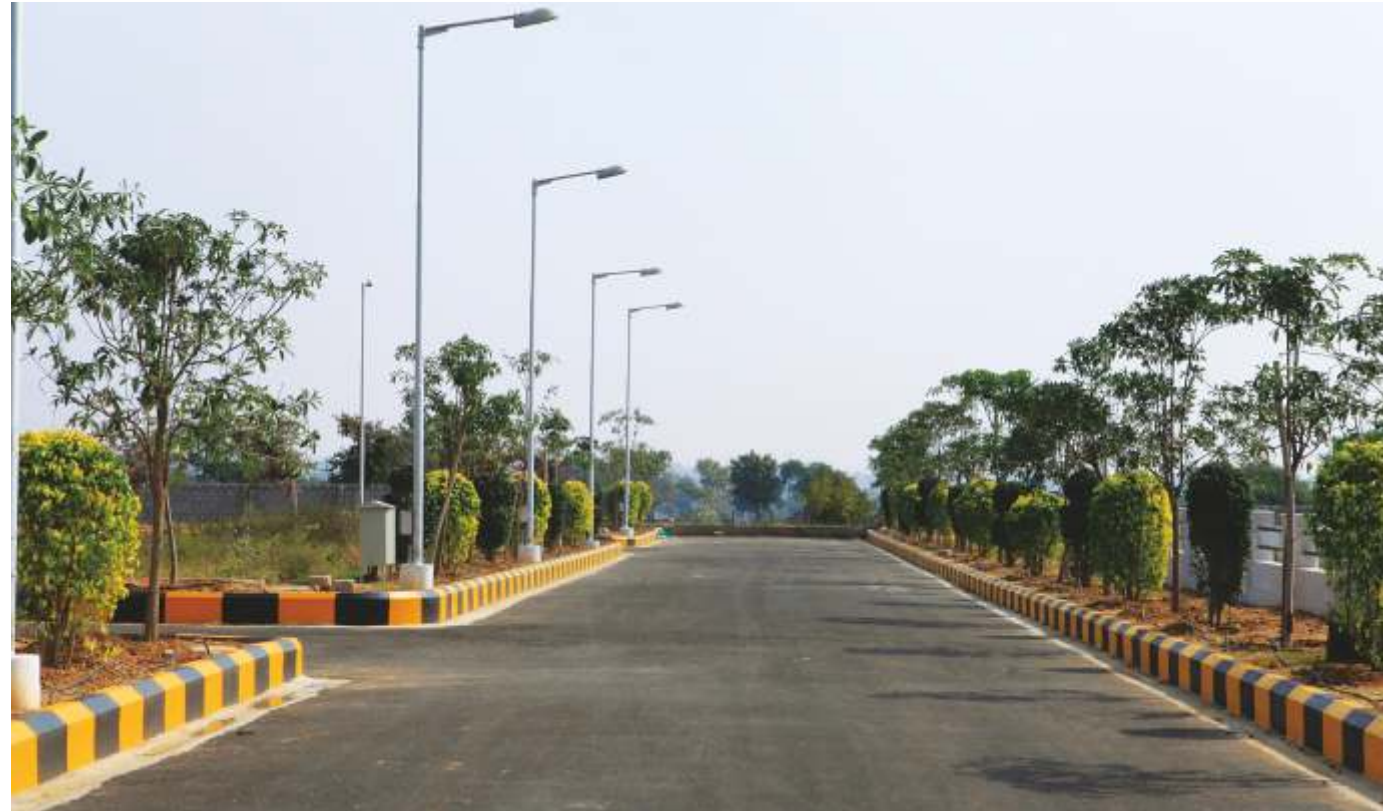
Our Completed Venture in 7-Phases @ Mokila