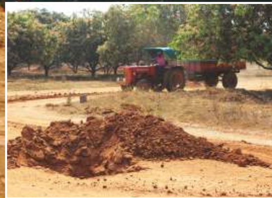
Actual Images at Green Meadows (March 2018)