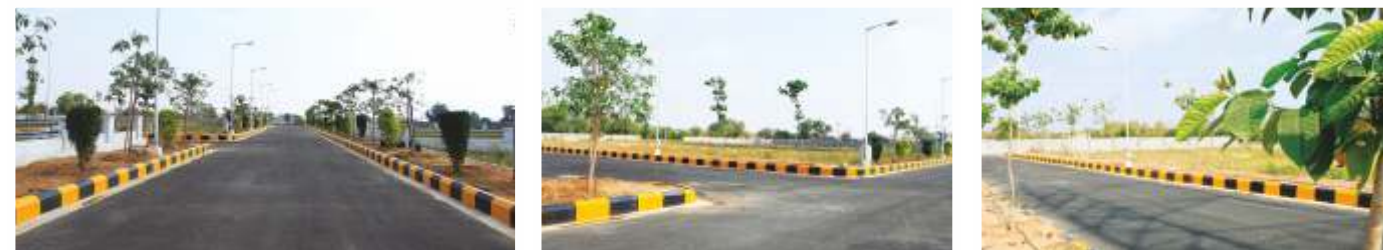
Actual Images of the development at Gachibowli County, Mokila