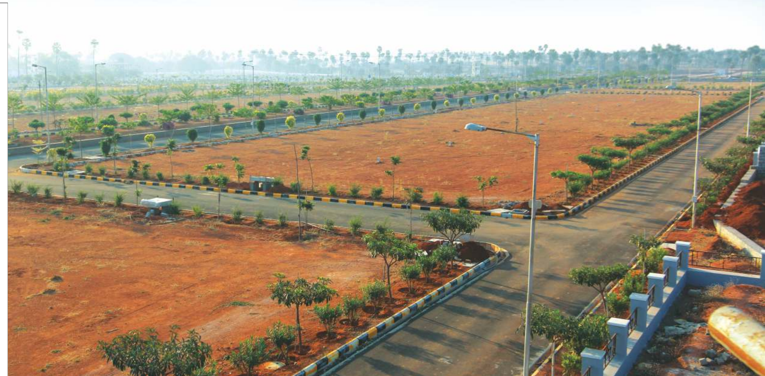
Actual Images at Aerospace County, Adibatla