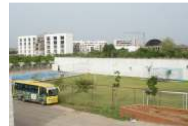
THE GAUDIUM SCHOOL