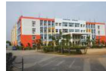
NARAYANA NARMADA COLLEGE