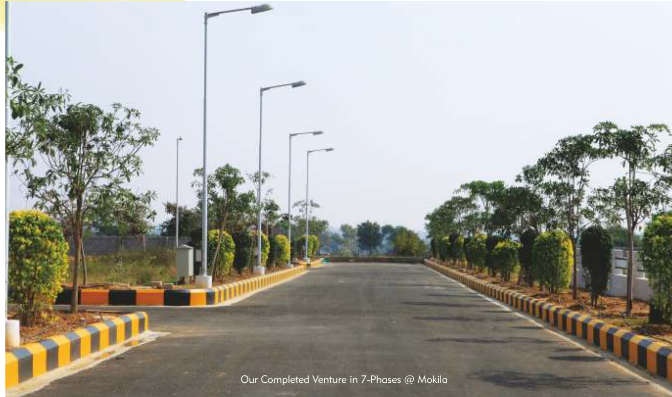
Our Completed Venture in 7-Phases @ Mokila

Green City Dukes County is promoted by Green City Estates in association with Dukes. Both companies are among the most trusted Real Estate Developers in Hyderabad. For over 30 years, the promoters are in forefront of identifying first class properties and transforming acres of land into priceless plots. Thousands of customers benefitted from Green City properties developed in strategic locations that promise lifestyle, connectivity and rapid appreciation. Dukes, is a renowned name with international presence in the field of biscuit manufacturing and confectionary, and brings forward a wealth of corporate experience with them. They join to offer great value in investment to esteemed customers.