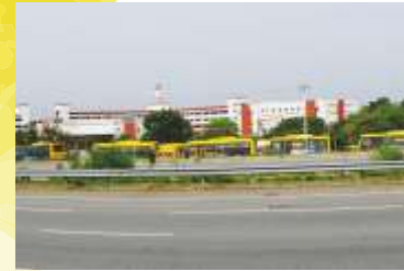
SAMASHTI INTERNATIONAL SCHOOL