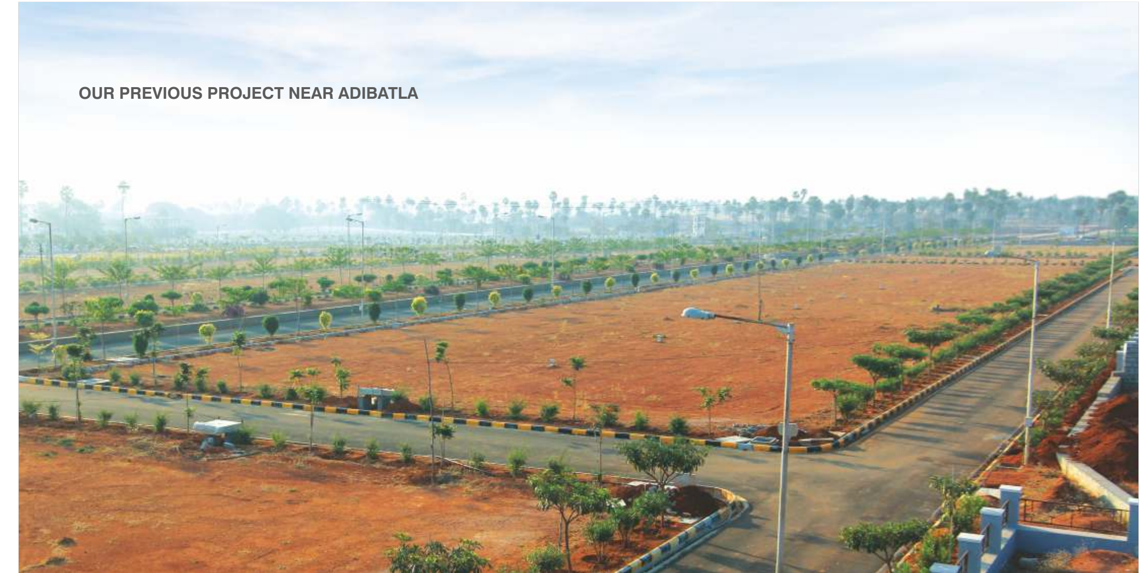
Actual Images at Aerospace County, Adibatla