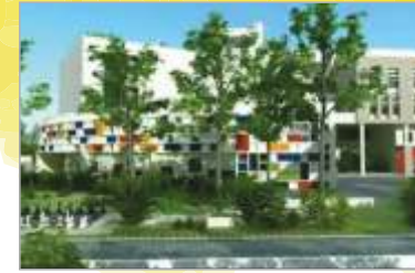
OPEN MINDS - A BIRLA SCHOOL

THE PROJECT IS SURROUNDED BY SEVERAL INTERNATIONAL SCHOOLS!