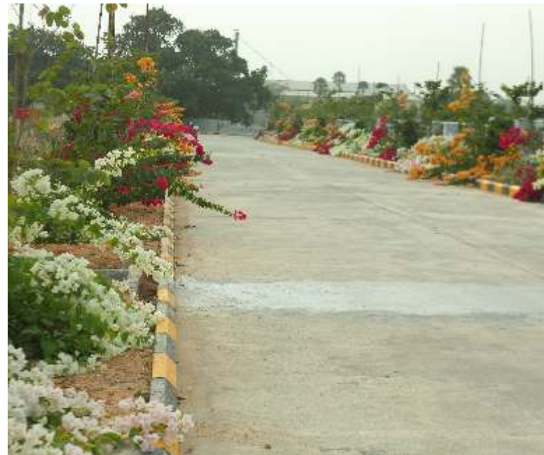
*Actual pictures of the site