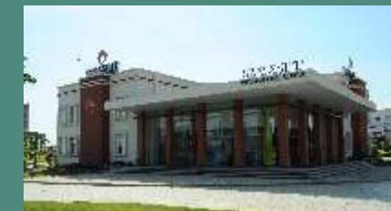
Samashti International School