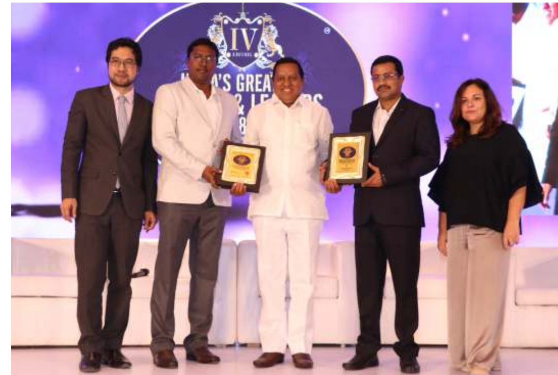
INDIA'S GREATEST BRAND & LEADER AWARD FOR 2018 - 19 Awarded by United World Group (Asia One), Chosen from Industry & Consumers Survey by Deloitte & Touche